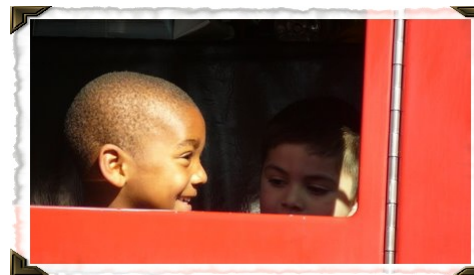
The Fire Department visits The Play House North